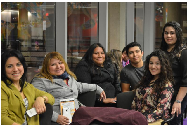
RASP students during the Second College Fair Seminar at MOLA