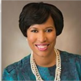
Muriel Bowser, Mayor

You may unsubscribe if you no longer wish to receive our emails.